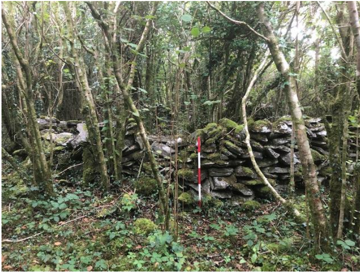
Plate 1: CH A, facing northeast

The field boundary that the site abuts is not present on the first edition OS map of 1841, but is marked by the time of the 1895-1900 map. This suggests the earliest date of the feature is mid-19th century, although it is not marked on any of the historic mapping. It is possible that the enclosure represents the remains of a pen or enclosure for livestock, which were a common feature of the post medieval landscape, especially in marginal terrain, such as the environs surrounding the site, where stock may range a wide area.