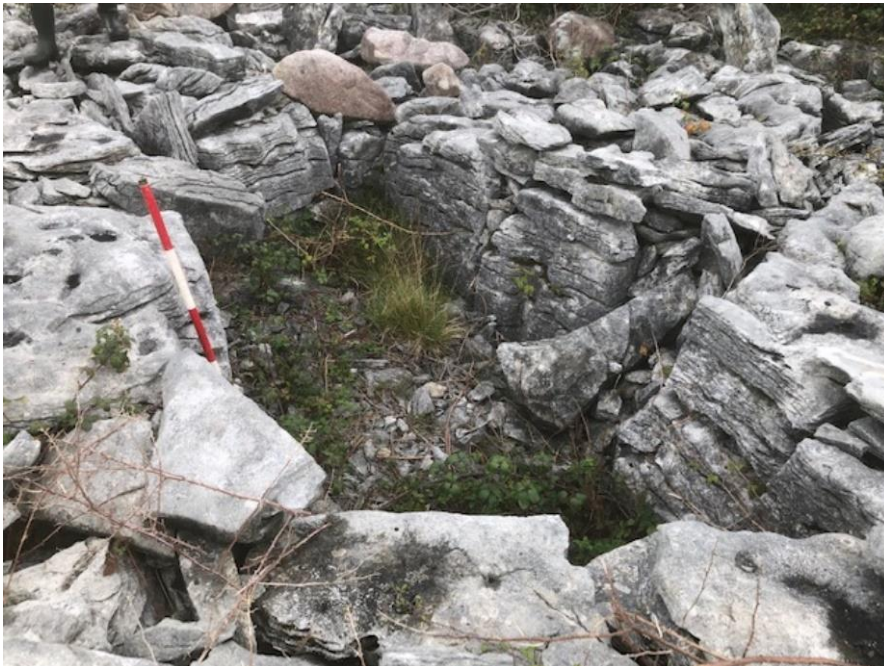
Plate 4: CH C, facing southwest

The site will not be directly impacted by the proposed N6 GCRR, being 72m away from the proposed development boundary. Given the level of dense vegetation in the area between the feature and proposed N6 GCRR, indirect negative impacts are not predicted. The level of predicted impact is deemed to be neutral and no further mitigation is required.