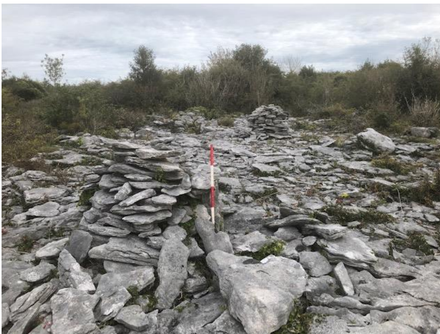
Plate 3: CH B, facing north

The site will not be directly impacted by the proposed N6 GCRR, being 65m away from the proposed development boundary. Given the distance of the site from the proposed N6 GCRR and vegetation that lies in between, indirect negative impacts are not predicted. The level of predicted impact is deemed to be neutral and no further mitigation is required.