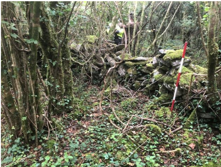
Plate 2: CH A, facing southwest