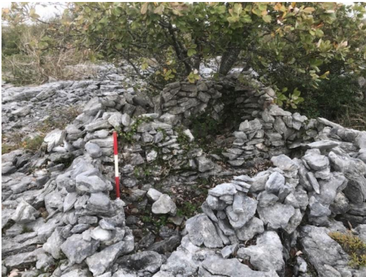
Plate 5: CH D, facing northwest

This small built feature is located c. 92m southwest of the proposed road scheme within an area of limestone pavement. The feature comprises two small rectangular areas defined by roughly constructed drystone walls (Figure 1, Plate 5). The upstanding walls stand to a height of c. 1m and the walls abut a stone field boundary wall, which is first marked on the 1928-29 OS map. This indicates that the feature was constructed between 1895 and 1929. The function of this feature is not clear, but it may have been used as a booley hut or similar small shelter, in use whilst animals were being tended in a marginal landscape.