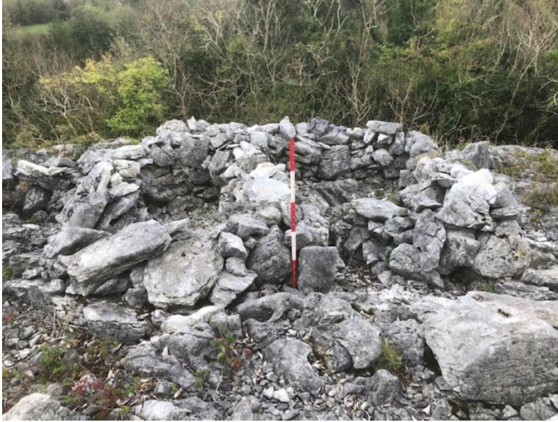
Plate 6: CH E, facing southwest